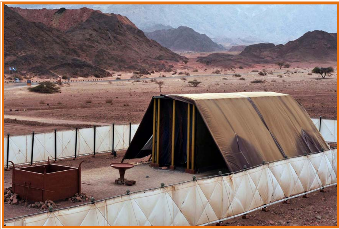
TABERNACLE IN THE WILDERNESS