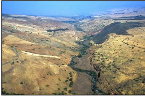
Jordan River in the South