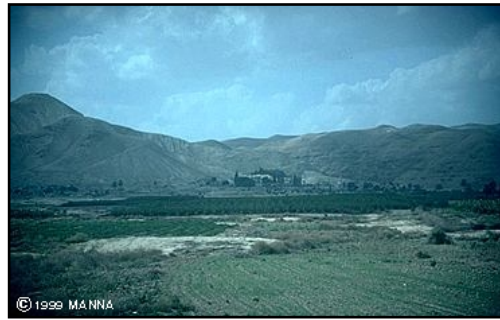
Ruins of Ancient Jericho