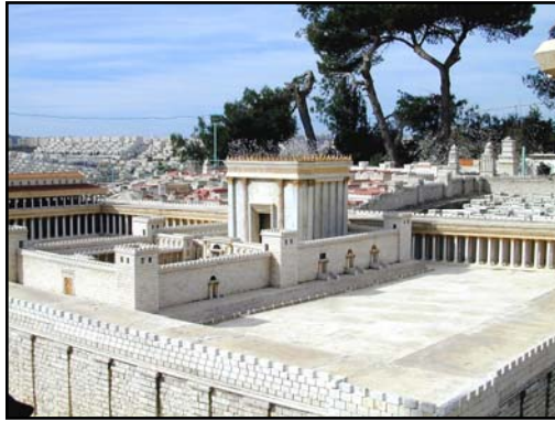
Model of Herod's Temple