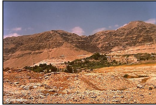
Mount of Temptation