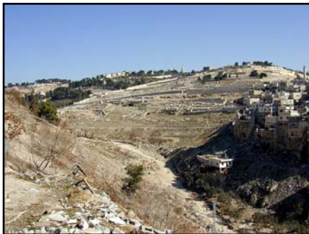
Mt. of Olives

On the right in this picture is the Mt. of Olives from which Jesus ascended into heaven. The Kidron Valley is below. The Garden of Gethsemane is to the left on the slop of the Mt. of Olives, and the base of the temple mount begins to the left in the picture.