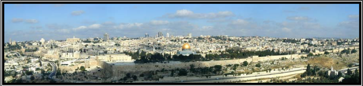
Panoramic View of Jerusalem