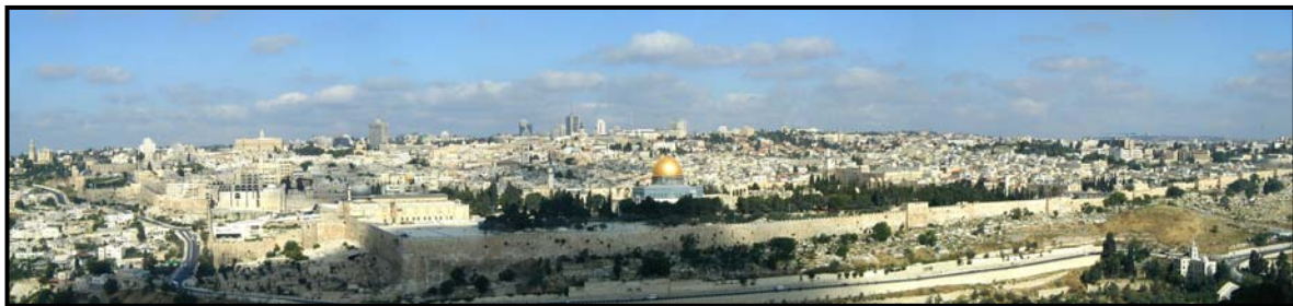
Panoramic View of Jerusalem from Mt. of Olives