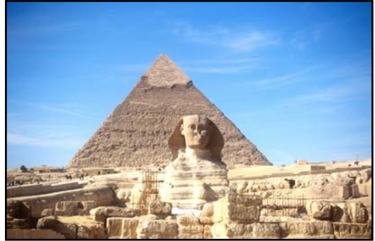
What Joseph and Mary would have seen in Egypt