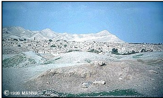
Modern City of Jericho