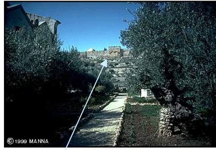
View of Golden Gate from Gethsemane