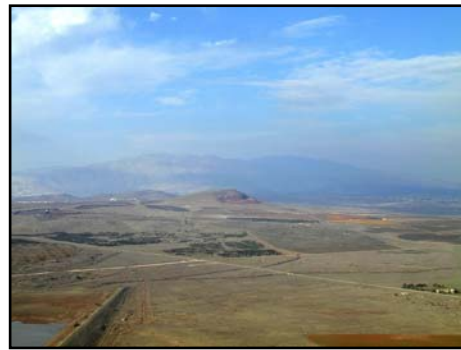
Mt. Hermon, Possible Mount of Transfiguration