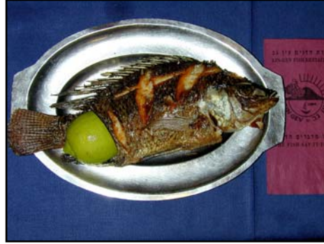
Saint Peter's Fish from Sea of Galilee