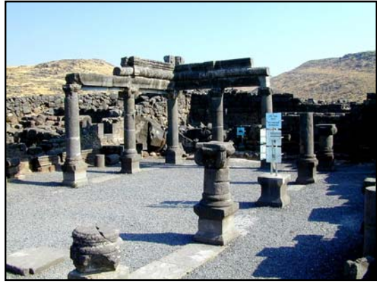
Ruins of Chorazin Synagogue