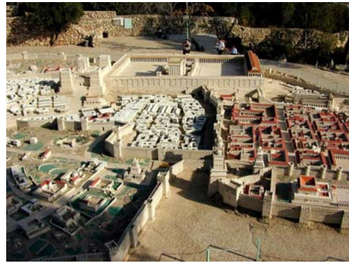
Model of Temple and surroundings