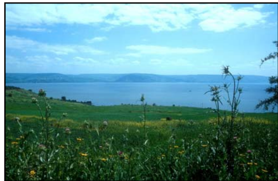
View of Sea of Galilee from Mt. of Beatitudes