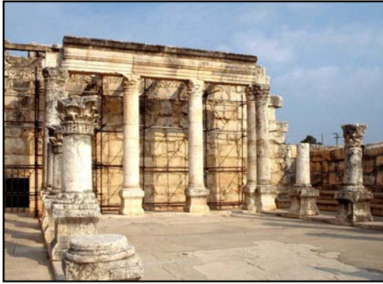
Ruins of Capernaum Synagogue