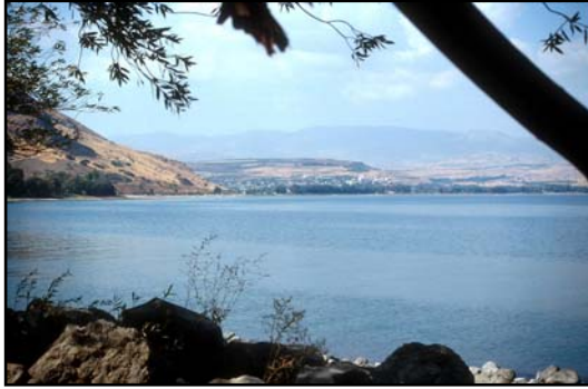
Sea of Galilee looking north