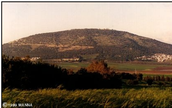
Mt. Tabor, Possible Mount of Transfiguration