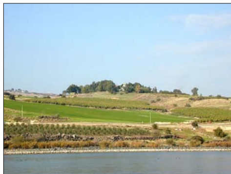
View of Mt. of Beatitudes from Sea of Galilee