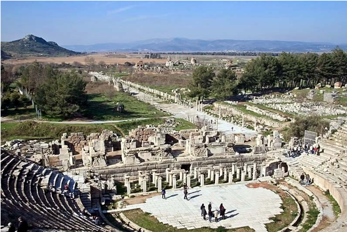
Ephesus Ruins: Arcadia Street and Amphitheater